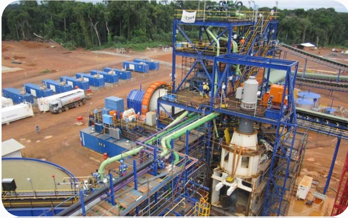
2-50MW Diesel Power Plant