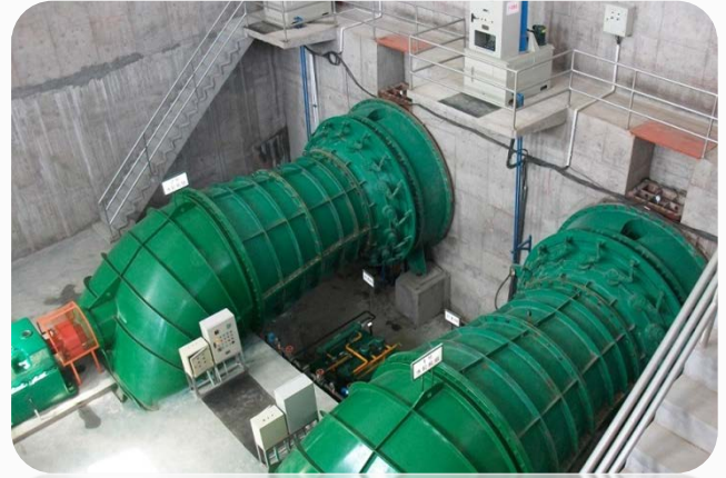
0.2-50MW Hydropower Plant